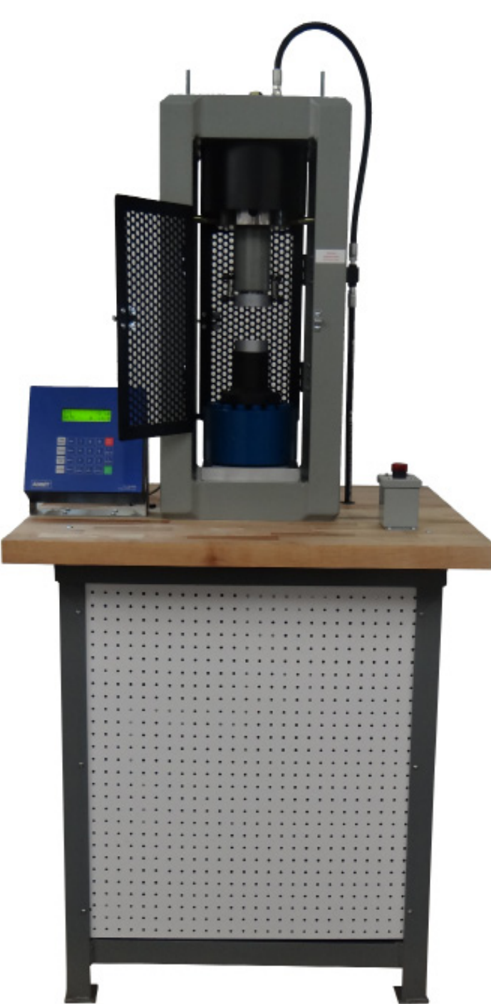
Concrete testing frames equipped with MegaForce and Gauge Buster 2 Indicator

ADMET's MegaForce Automatic Testing System offers a low cost servo-controlled solution for error-free testing of concrete beams, cylinders, and cubes. MegaForce can also be easily retrofitted to existing manually operated concrete testing machines. Most concrete tests are performed with manually operated testing machines which are susceptible to test rate errors because the operator does not adjust the manual control valve properly. MegaForce eliminates compressive and flexural strength errors because it automatically maintains the specified ASTM test rate throughout the entire test.