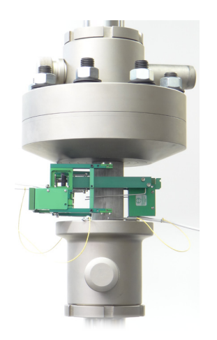
Concrete cylinder sample for ASTM C469 Testing

ADMET offers eXpert 1600 series Servo-Hydraulic Testing Machines to measure the compressive modulus and poisson's ratio of concrete. The 1600 series servo controlled test machine includes the MTESTQuattro Materials Testing System plus axial and transverse extensometers or a compressometer fixture.