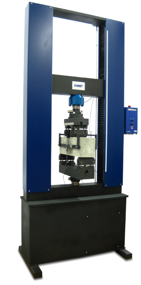
eXpert 2654 100 kN system configured for ASTM C1609 testing

ASTM C1609 specifies that the test must be performed in servo control at very slow net deflection rates. ADMET is one of the only testing machine manufacturers in the world that offers equipment to perform this demanding standard. Almost all C1609 tests can be performed on a 100kN (22,500 lbf) testing machine. ADMET offers a complete C1609 test package which includes our eXpert 2654 Dual Column Testing Machine equipped with the MTESTQuattro® Materials Testing System and the 3-point bend fixture with associated transducers to measure net deflection.